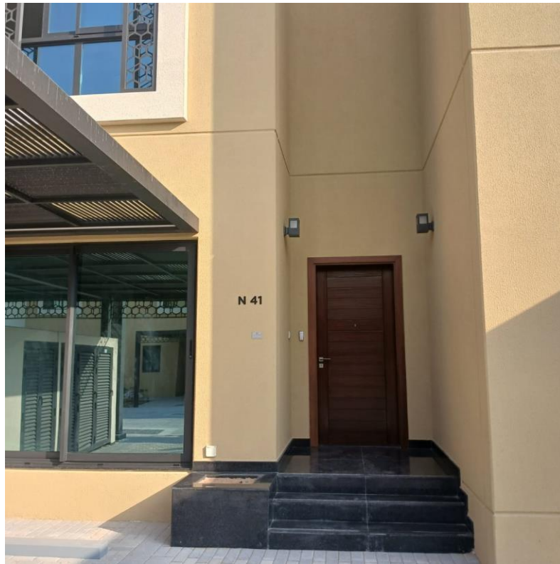
Villa N41 sustainable city